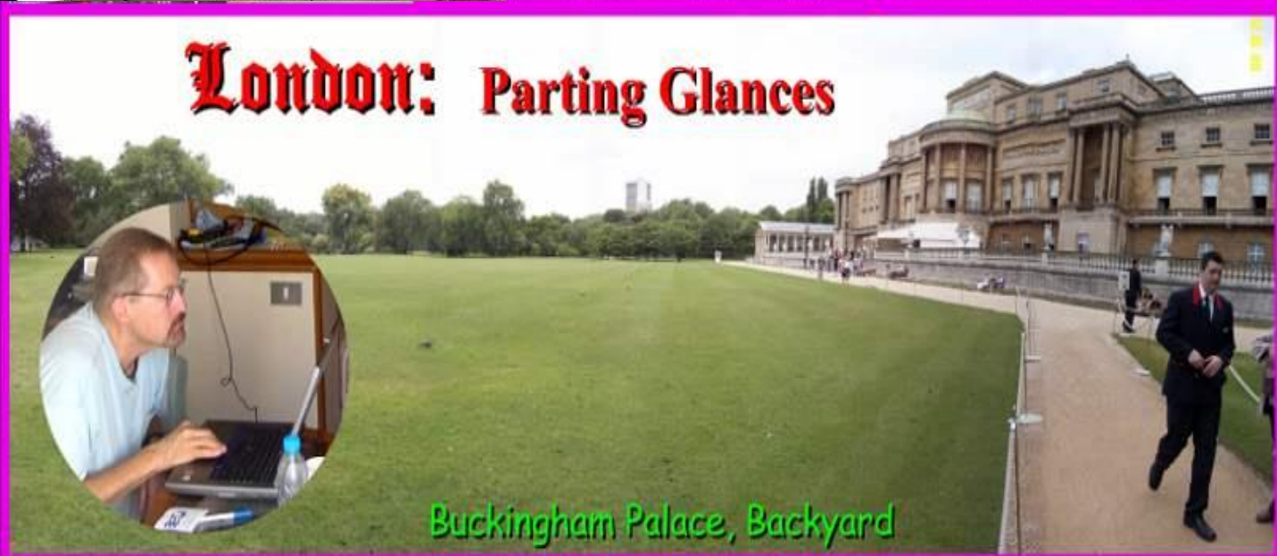
Buckingham Palace, Backyard