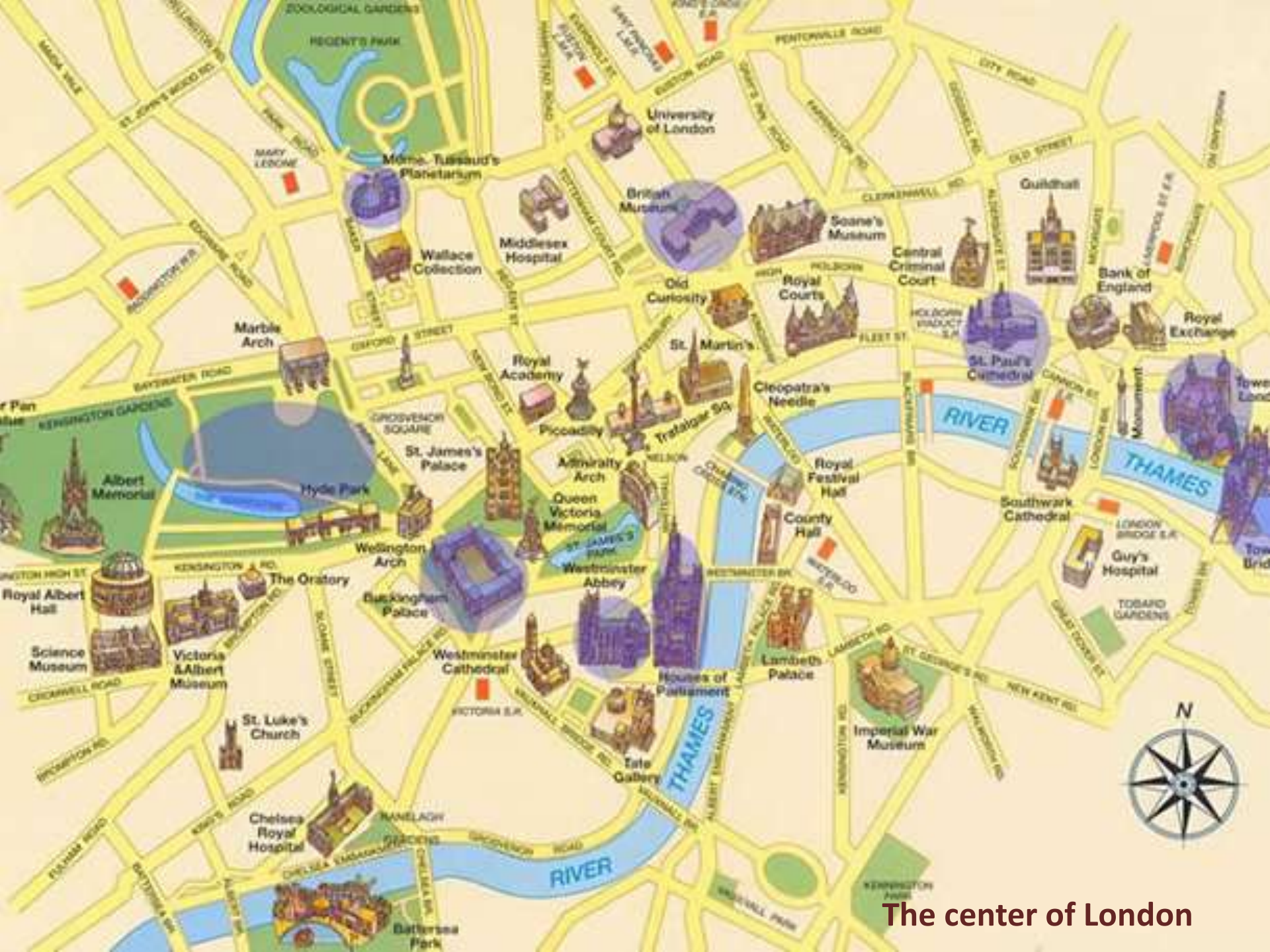
The center of London